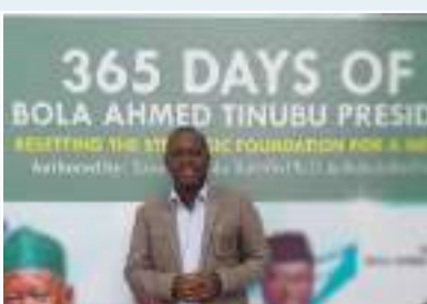
Ikale news publisher launches boo on Tinubu Books