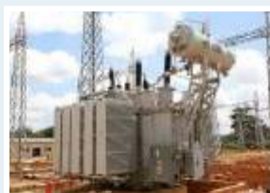
NNDC rescues Ondo South from 17 years of blackout