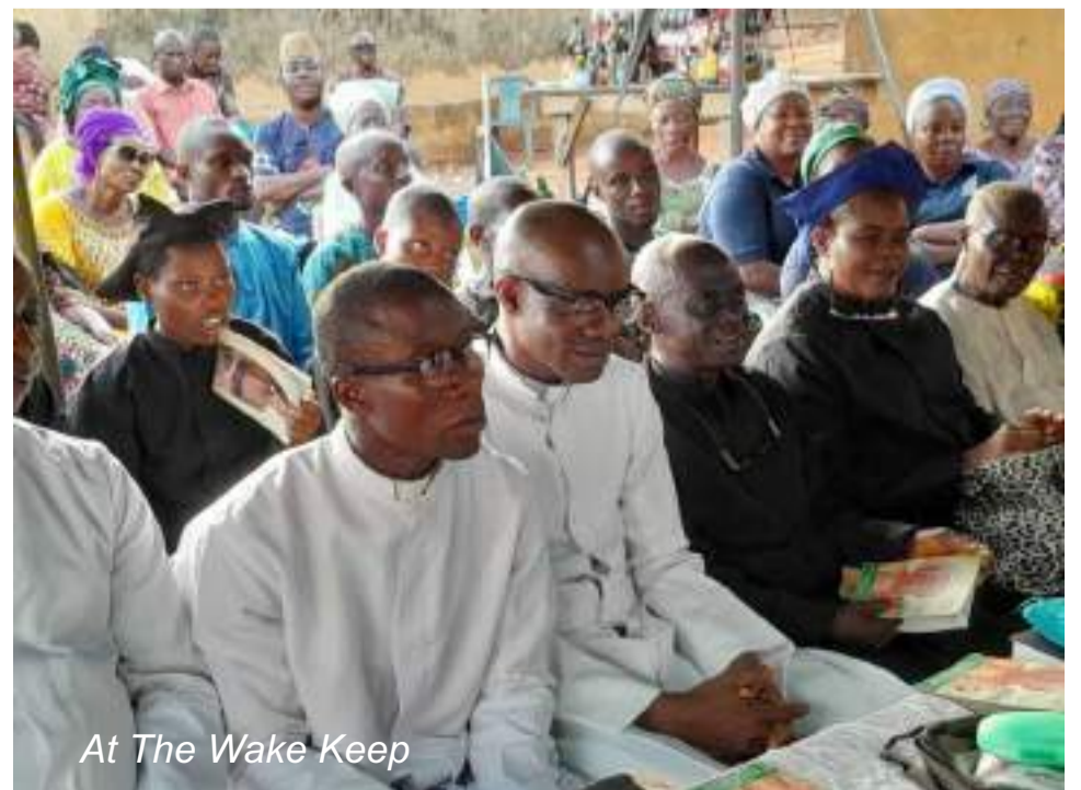
At The Wake Keep