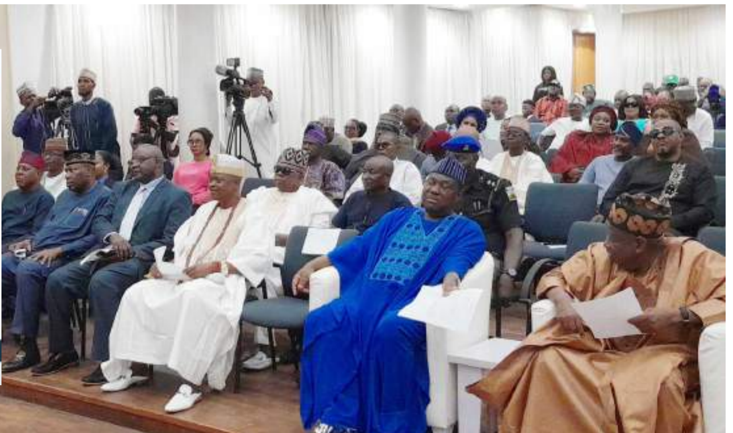
Cross Section of Dignitaries